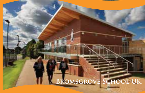
BROMSGROVE SCHOOL UK