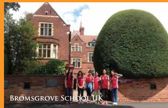
BROMSGROVE SCHOOL UK