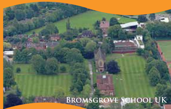
BROMSGROVE SCHOOL UK

Facebook: https://www.facebook.com/bist.summercamp