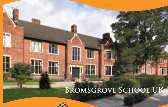
BROMSGROVE SCHOOL UK