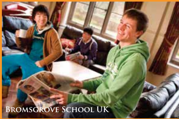
BROMSGROVE SCHOOL UK

HOSTED BY BROMSGROVE INTERNATIONAL SCHOOL THAILAND For more details: School office: 02 989 4873 Email: enquiries@bromsgrove.ac.th Facebook: https://www.facebook.com/bist.summercamp