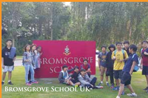
BROMSGROVE SCHOOL UK