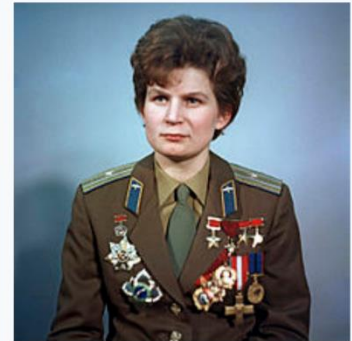
Tereshkova in 1969

A handwritten signature in cursive script, likely reading 'Валентина Терешкина'.